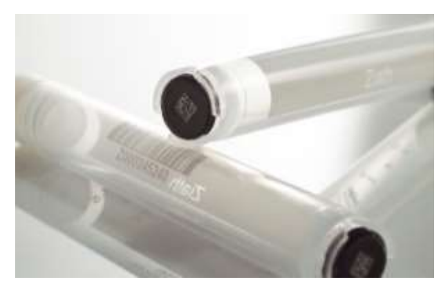
The 2D code is automatically generated from the linear barcode during the manufacturing process