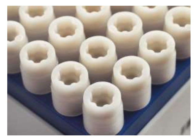
The screw-cap design is suitable for use with an automatic decapper.